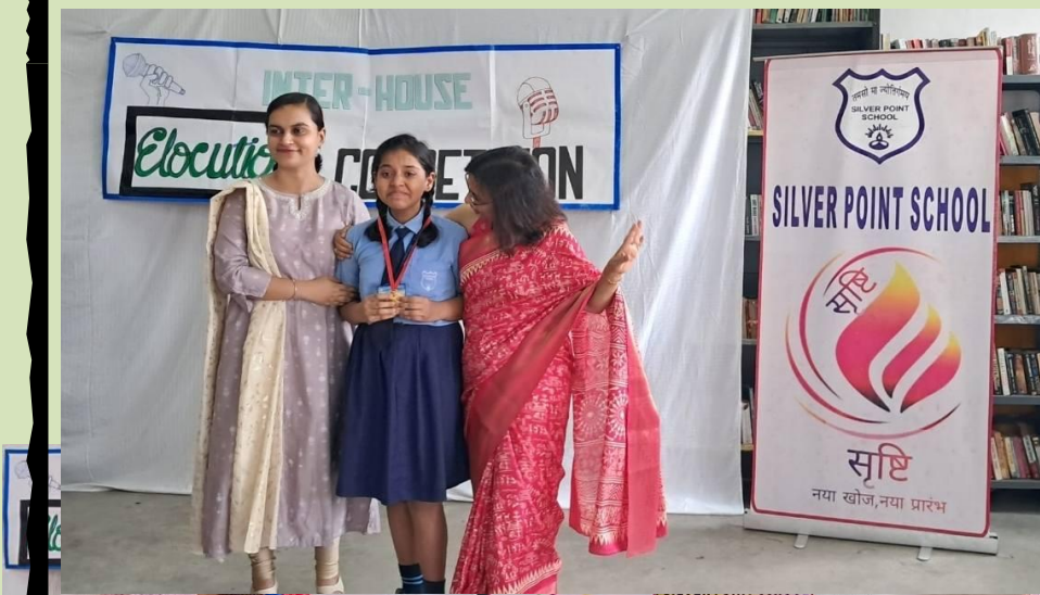
Elocution Competition in Hindi language. Silver Point School endeavours to have confidence in future.